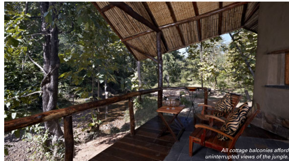
All cottage balconies afford uninterrupted views of the jungle.