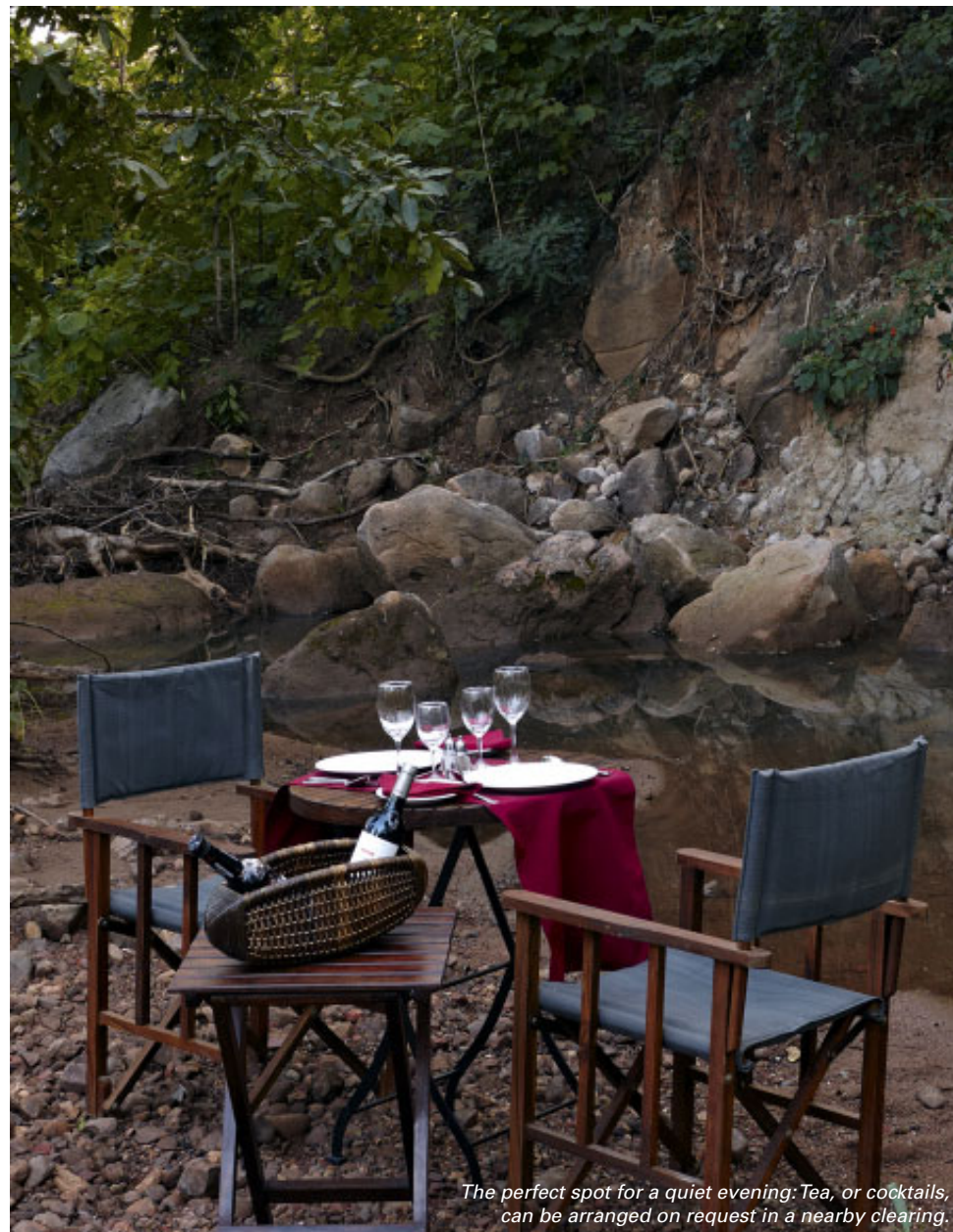
The perfect spot for a quiet evening: Tea, or cocktails, can be arranged on request in a nearby clearing.