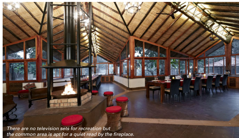
There are no television sets for recreation but the common area is apt for a quiet read by the fireplace.

The lodges being totally eco-friendly, there are no water-depleting bathtubs – there is an open air shower instead; there are no televisions or music systems (playing loud music is in fact discouraged) and there are no telephones either. So don't expect 'room