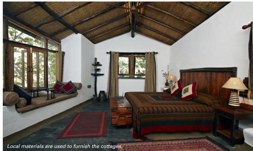
Local materials are used to furnish the cottages.

service' of the hotel kind. Instead, fixed meals are provided and the menu is home-style, using locally available fruits and vegetables. On the other hand, dinner or tea can be arranged in a clearing or by a picturesque waterfront – though these do involve considerable effort on part of the staff, something we city dwellers must not forget. I have cocktails one evening under a totally darkened, no-moon sky by the light of old-fashioned lanterns hung from trees, sitting on roughly hewn benches and boulders. It is a surreal experience and one that is to be cherished.